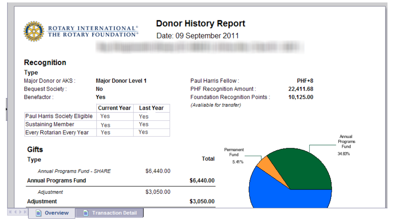
Figure 1: Example of a donor history report

From the Contribution and Recognition Reports page, click the name of the report you want to run. The report will appear in a new window.